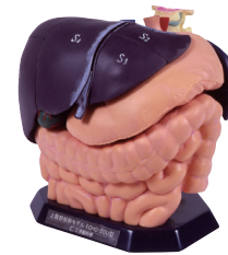
Full set includes anatomical model "ECHO-ZOU"